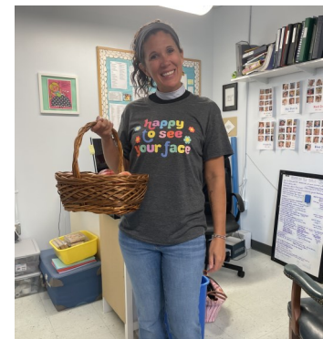
EPS Staff 2023-2024 School Year